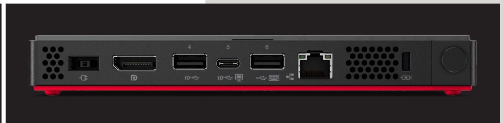
ThinkCentre M75n Thin Client