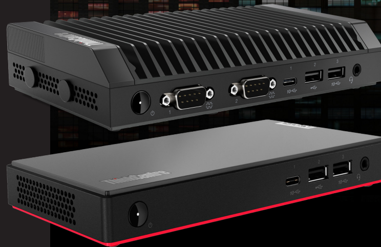
ThinkCentre M75n IoT Thin Client

These devices are not only ideal for shrinking workspaces and employees who are in the office one day and working from home the next, they are also an IT administrator's dream come true. They have the performance needed to quickly and easily access software and data in the cloud. Plus, software patches, security updates, and more can be activated for all users at once, which speeds up deployment and improves efficiency. When you pair Lenovo's proven security and durability with the affordability factor of a thin client device, the result is a portable, affordable Nano PC that still offers the dependable data and device protection businesses need.