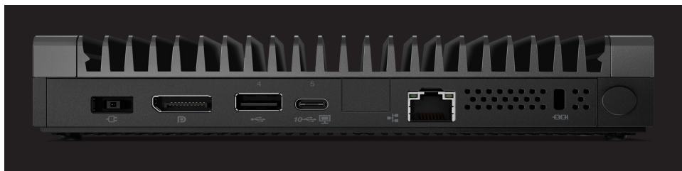
ThinkCentre M75n IoT Thin Client

We continually strive for perfection in what was already near perfect, like creating super thin devices with maximum mounting flexibility. For this, we employed laser drilling to achieve an even smaller printed circuit board assembly and created a tailored cooling system for the extreme narrow space.