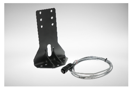
MFT10/MFT12 Mounting kit flat Quick Change System