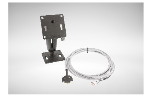
MFT10 Mounting kit RAM Mount