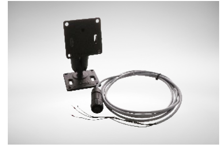
MFT10 Mounting kit RAM Mount Quick Change System