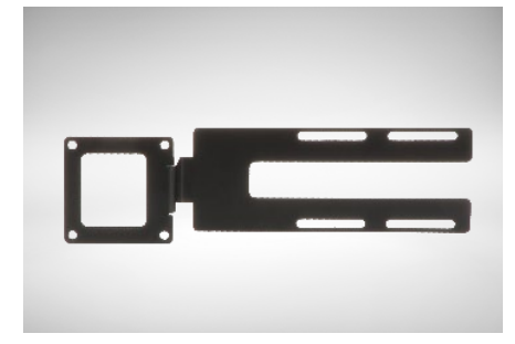
Mounting Kit for MFT1x sideward Keyboard