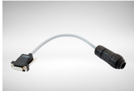
Quick Change System Adapter (3 wired)