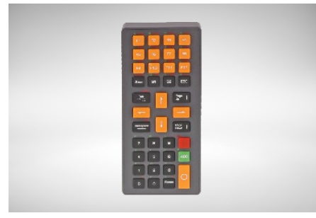
MFT1x sideward Keyboard with USB-Hub