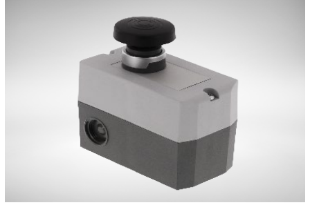
ACD EasyToPush - Radio Button Black