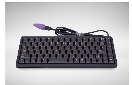
ML Keyboard black