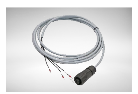
Quick Change System Power Supply Cable (3 wired)