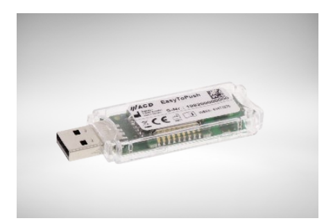
ACD EasyToPush - USB Gateway