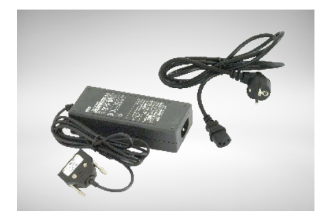
Power pack MFT1x