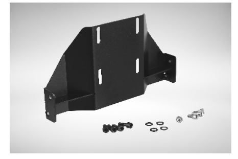
MFT1x Mounting kit Adapter bracket