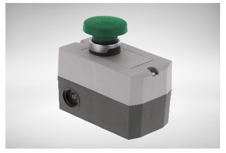
ACD EasyToPush - Radio Button Green