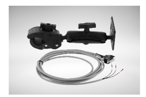
MFT1x Mounting kit RAM Mount with holding clip