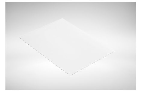
MFT10 screen protector for resistive touch screen

Configure your equipment directly in the online configurator at: <a href="https://www.acd-gruppe.de/en/vehicle-terminal-configurator/">https://www.acd-gruppe.de/en/vehicle-terminal-configurator/</a> Our sales department will also be happy to help you with the selection under the telephone number +49 7392 708-499