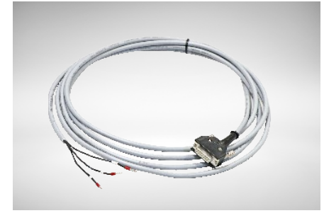
Voltage Supply Cable (3 wired)