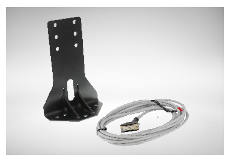
MFT10/MFT12 Mounting kit flat Standard