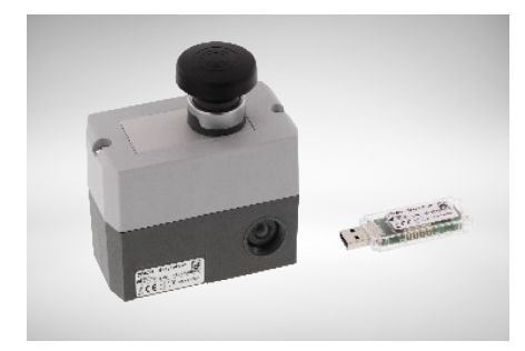
ACD EasyToPush Set - Radio Button Black & USB Gateway