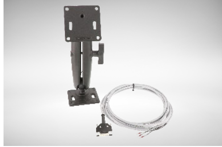
MFT12/MFT15 Mounting kit RAM Mount