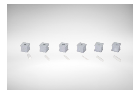
Spout Set for interface cable