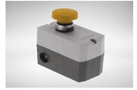
ACD EasyToPush - Radio Button Yellow