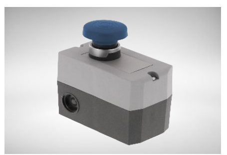
ACD EasyToPush - Radio Button Blue