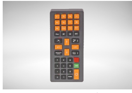
MFT1x sideward Keyboard without USB-Hub