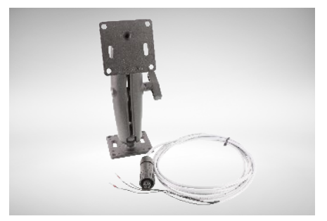
MFT12/MFT15 Mounting kit RAM Mount Quick Change System