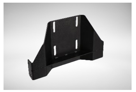
MFT1x Adapter bracket