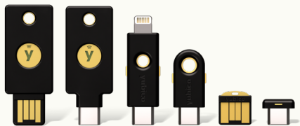
YubiKeys: Phishing-resistant MFA and Passwordless

YubiKey as a Service customers have access to subscription-exclusive YubiEnterprise services and additional capabilities. They are also eligible for pre-configured security keys available through Yubico FIDO Pre-reg, enabling users to be protected seamlessly in minutes.